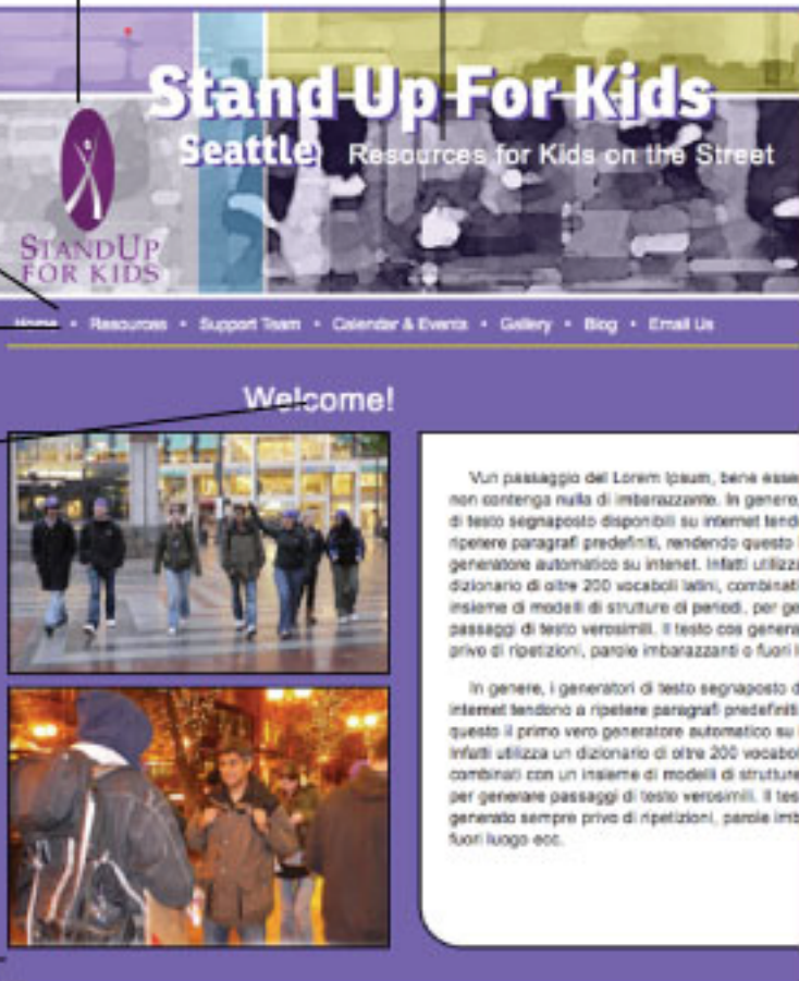
All images, text, and links unless otherwise noted ©7 Seattle - December 9, 2011 Stand Up For Kids - Home - Back To Top