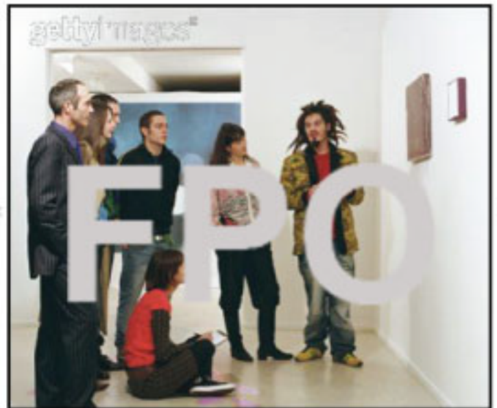
Caption un lun passaggio del Lorem Ipsum, bene essere certi che non contenga nulla di imbarazzante.

Un lun passaggio del Lorem Ipsum, bene essere certi che non contenga nulla di imbarazzante. In genere, i generatori di testo segnaposto disponibili su internet tendono a ripetere paragrafi predefiniti, rendendo questo il primo vero generatore automatico su internet. Infatti utilizza un dizionario di oltre 200 vocaboli latini, combinati con un insieme di modelli di strutture di periodi, per generare passaggi di testo verosimili.